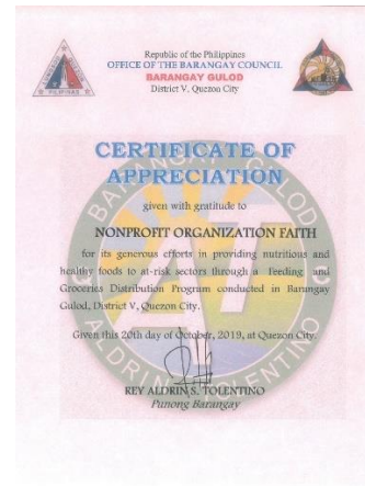
Certificate of appreciation in Quezon City district